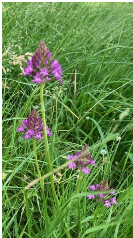
3 Pyramidal Orchids photographed recently by Jane in New Ash Green